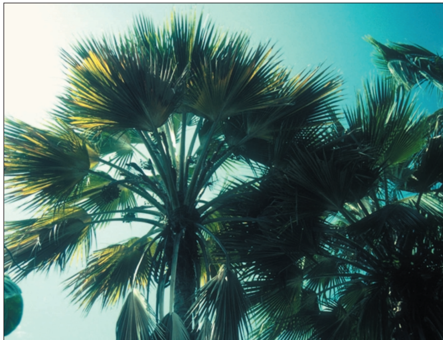
Figure 3. Lo’ulu palm ( Pritchardia affinis ) – no longer exists in the wild (USFWS 2004).

If different points along this continuum are to qualify as “recovered” given the necessary management or intervention to stabilize a population or habitat, the key issue becomes whether there is a reasonable certainty that the human intervention will continue. Consider a fire-depen-